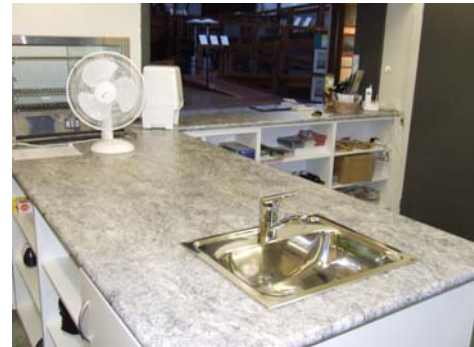
Coming up fine - installation from grant funds (Tasmanian Community Fund Grant)