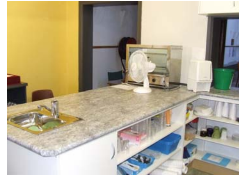
New bench top and cupboards in kitchen

Heart Beat of a River, commences with the Norfolk sailing across the Tamar Heads and then covers the many and varied aspects of both East & West Tamar areas. We hope to get more DVD's productions from Lionel for resale, so why don't you drop in and have a look at them on the "big screen" which should be up and running by mid March 2007. They would be a wonderful gift for overseas relatives or simply a great keepsake for your own library.