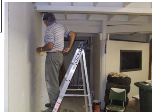
Norm hard at it