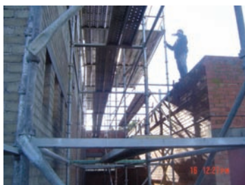
Scaffold up for the sheeters