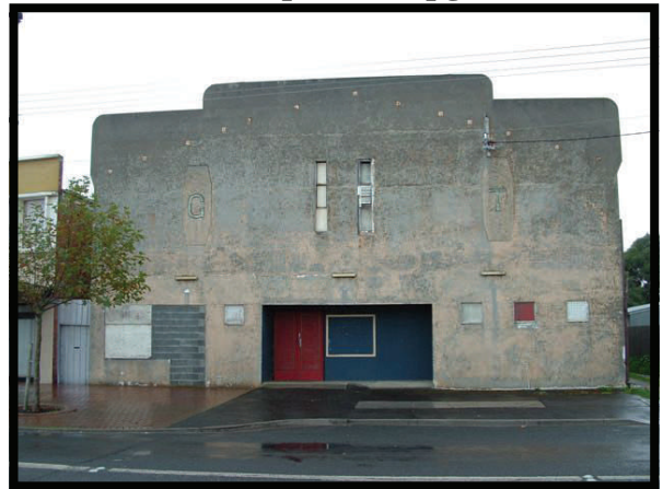
The future “look” for front of B&F Centre