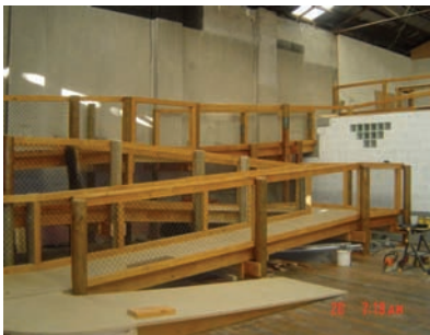
Ramps to the Mezz floor & wharf