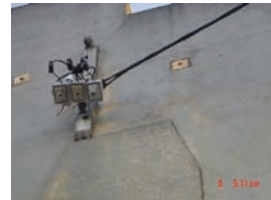
Power - from this on the front