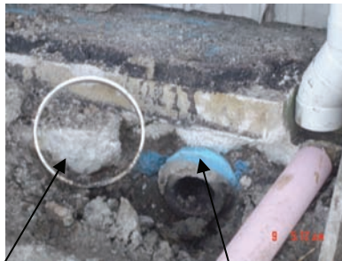
Size of new drains