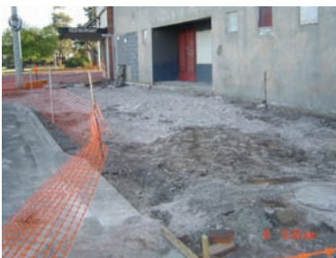
Front view at moment - guaranteed to get better